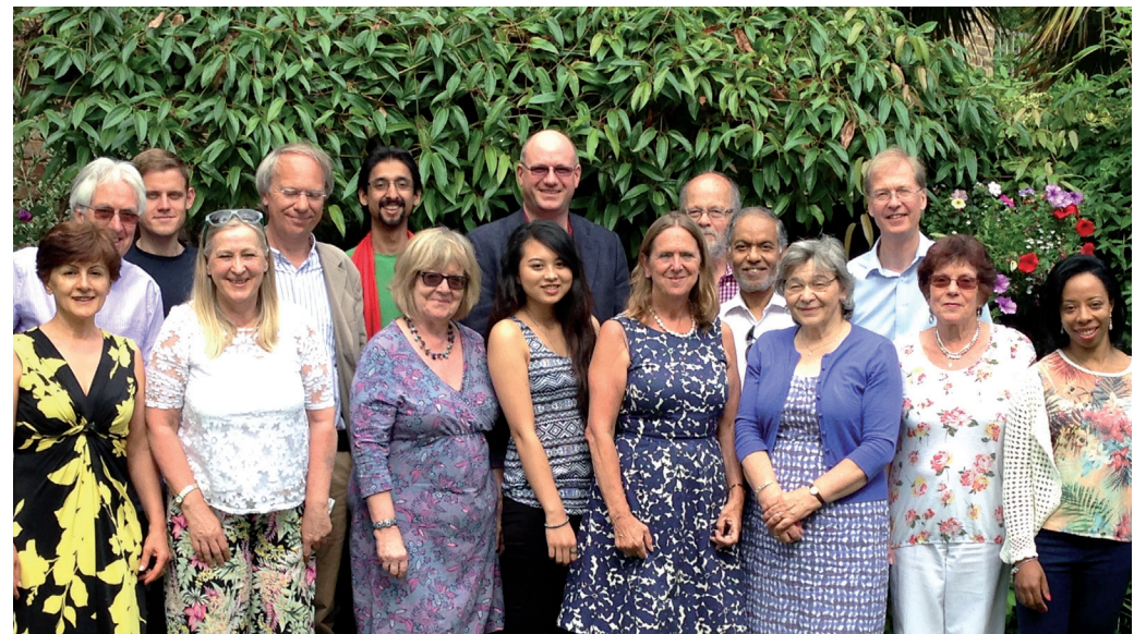
VOLUNTEERS AT THE AGE WATCH PARTY